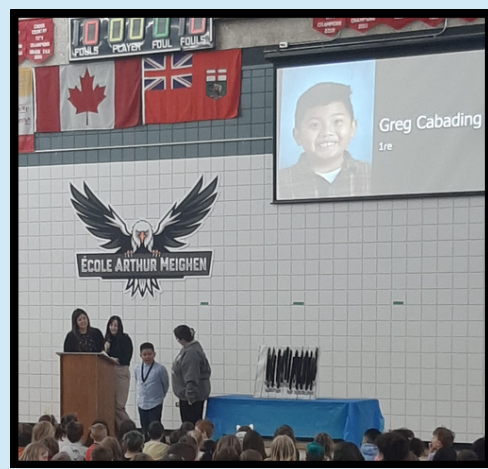
Congratulations to all the students who were recognized for speaking French!